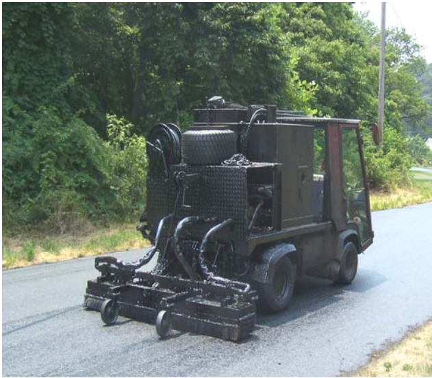
Phase II of Asphalt Rejuvenation project will Start at End of August